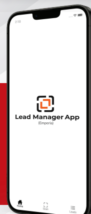
Lead Manager App