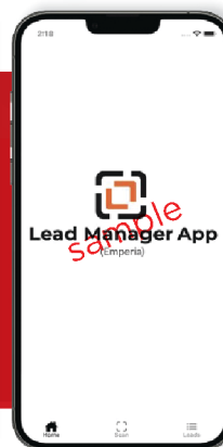
Lead Manager App