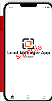
Lead Manager App